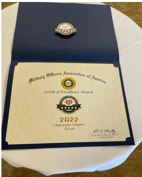
Five Star Award Medallion and Certificate awarded to Clearwater Chapter for the third Consecutive year.